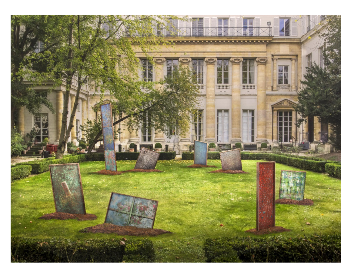
Installation 'Hôtel de Galliffet' by Sergio Mario Illuminato (2024)

www.iosonovulnerabile.it/practive-performative/2024-2/ www.instagram.com/iosonovulnerabile/ www.facebook.com/iosonovulnerabile/ https://iicparigi.esteri.it/it/ www.instagram.com/iicparigi/